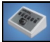
A-6WIN/RCB USB Desktop Speed Controller featuring push-button commands for Runorder and Bookmark management.