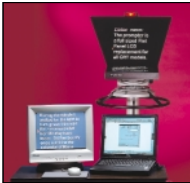
LAPTOP COMPUTER OPERATING IN DUAL-SCREEN MODE.