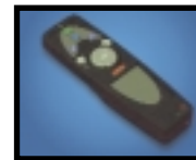
A-1649 Wireless RF Hand- Held Controller, omnidirectional to 100'. Recommended for variable speed regulation by the presenter. Also functions as a standard Windows mouse.